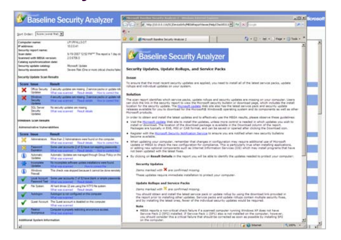
Microsoft Baseline Security Analyzer Report